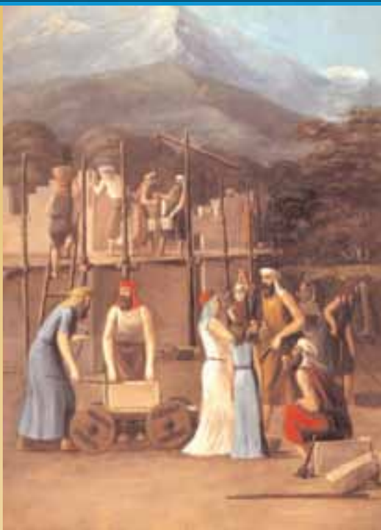
THE BUILDING OF THE TEMPLE, BY C. A. CHRISTENSEN

H appiness came to the Nephites as they worked hard to sustain themselves, learned from the holy scriptures, reared their families, and built a temple to the Lord.