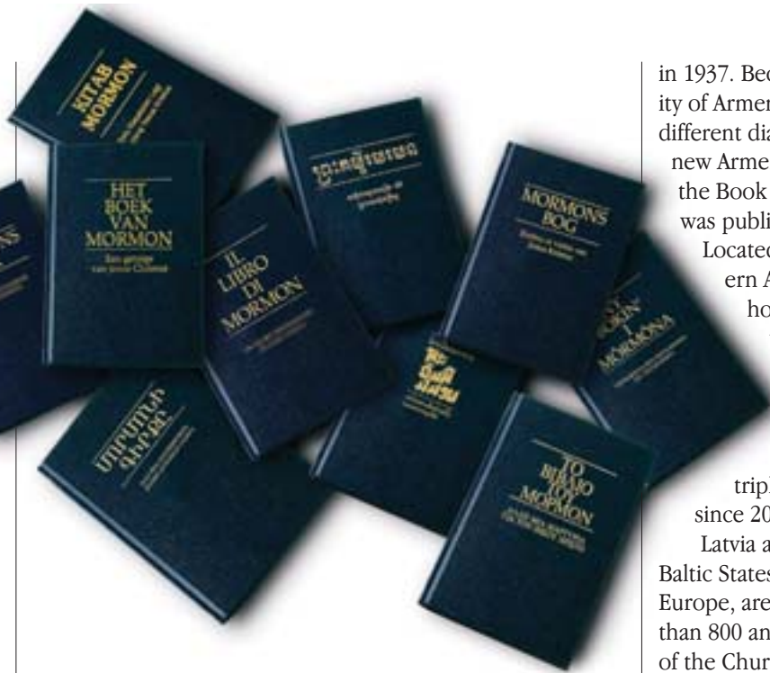
New translations of the Book of Mormon in Armenian, Latvian, Lithuanian, and Malagasy have been released, along with new triple combinations in those languages.

The first full edition of the Book of Mormon in Malagasy was published in 2000; selections from the book were published in 1986. Malagasy is a language spoken by the people in Madagascar, an island off the east coast of Africa. Just months after