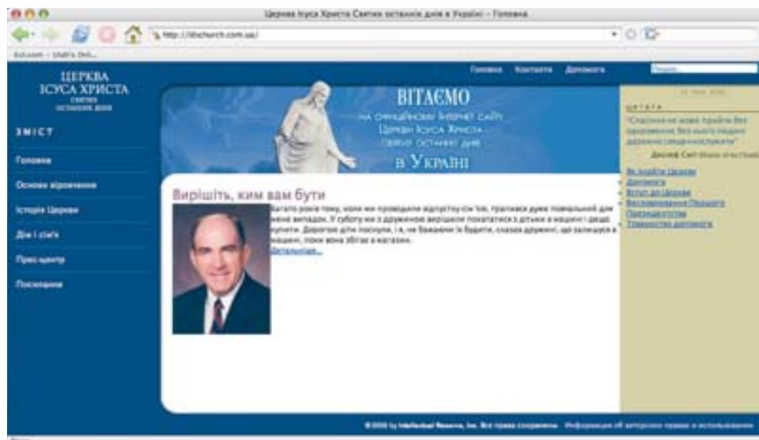
The new Ukraine country Web site is the Church's 61st in a six-year-old project aimed at providing information and resources around the world.