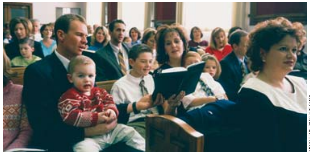
Now 50 years old, the beloved hymn, "I Am a Child of God," is sung around the world in more than 90 languages.

I am a child of God, And so my needs are great; Help me to understand his words Before it grows too late.