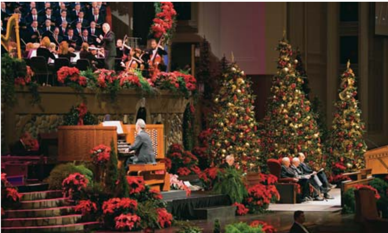
The First Presidency, bottom right, listens as the Mormon Tabernacle Choir and Orchestra on Temple Square perform during the 2006 First Presidency Christmas Devotional.