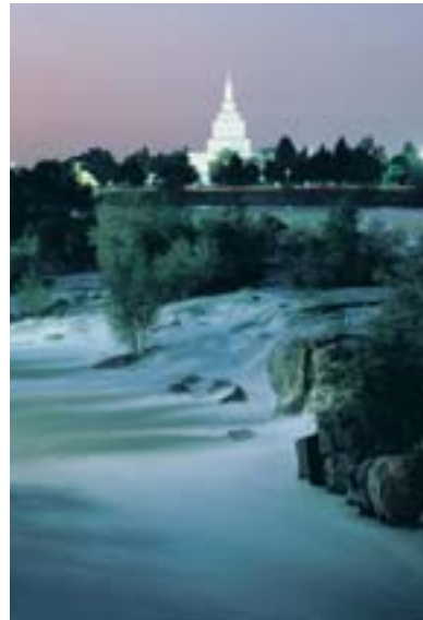
Idaho Falls Idaho Temple

which to administer these eternal ordinances. There is no adequate substitute on all the face of the earth” (“Temples and Temple Work,” Ensign , Feb. 1982, 4).