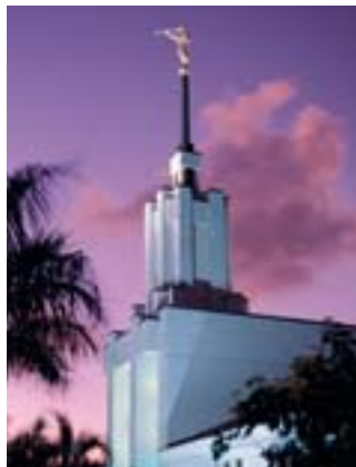
Nuku’alofa Tonga Temple by William Floyd Holdman

of God for the salvation of our dead” (in Conference Report, Oct. 1913, 87).