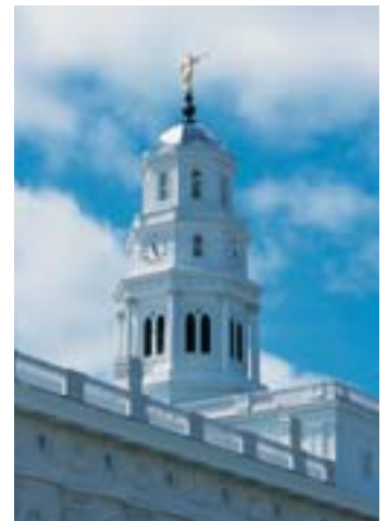
Nauvoo Illinois Temple