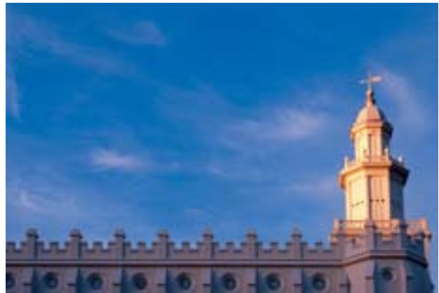
St. George Utah Temple