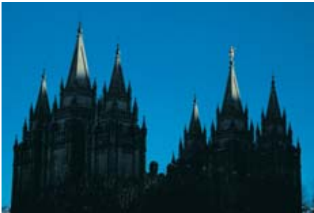
Salt Lake Temple by Alan Yorgason