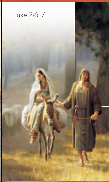
NAZARETH, BETHLEHEM, AND JUDEA