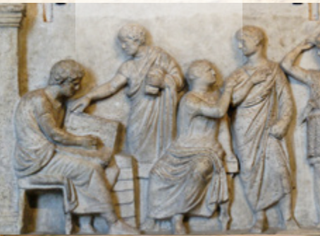
THE ROMAN EMPIRE

Luke 2:1-4; James E. Talmage, Jesus the Christ (1916), 91-92