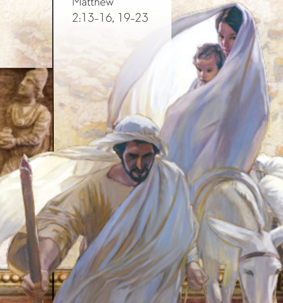
BETHLEHEM, EGYPT, AND NAZARETH

After eight days, Christ was circumcised and named, as was the Jewish custom. He was named Jesus, or “Yeshua,” which means “Savior” in Hebrew. Jewish custom dictated that a woman must wait 40 days after childbirth to enter the temple. After the 40 days were over, Mary and Joseph brought Jesus to be presented at the temple. There they met Simeon, who had been promised that he would see Christ before he died. He recognized Christ, held Him in his arms, and glorified God. He also prophesied of Christ’s mission on earth. Anna, a prophetess, also witnessed of Christ at the temple. She too testified of His mission.