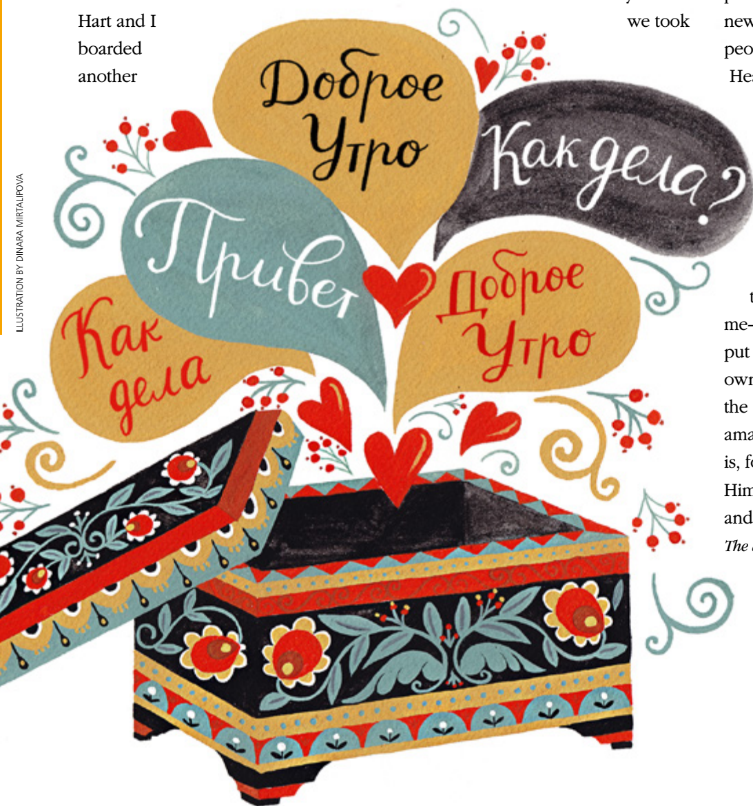
ILLUSTRATION BY DINARA MIRTAIPOVA