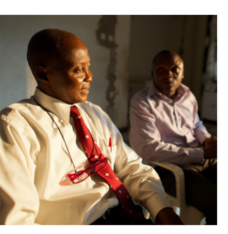
Be courageous by seeking counsel and correction from those you trust: a spouse, priesthood leaders, or supervisors. Ask them where you can improve in your personal discipleship.

Teachers of the gospel today need to accept the opportunity and the responsibility to teach the 21st century's young people correct principles about the plan, including the divinely sanctioned doctrine of marriage and the role of the family as defined in the proclamation on the family.<sup>11</sup>