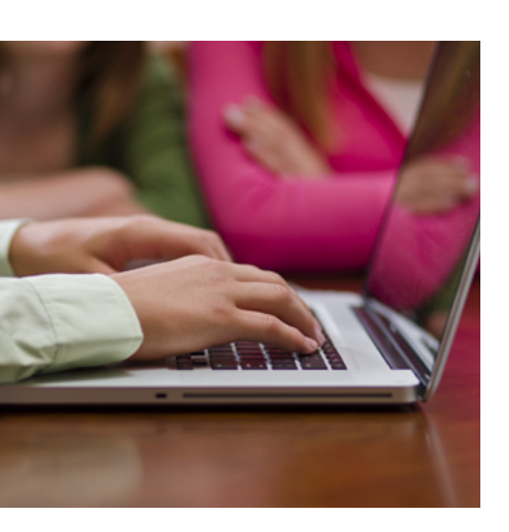
Many of our young people are more familiar with Google than with the gospel, more attuned to the internet than to inspiration, and more involved with Facebook than with faith.