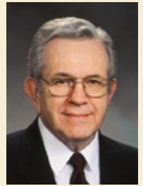
By President Boyd K. Packer (1924–2015)

President of the Quorum of the Twelve Apostles