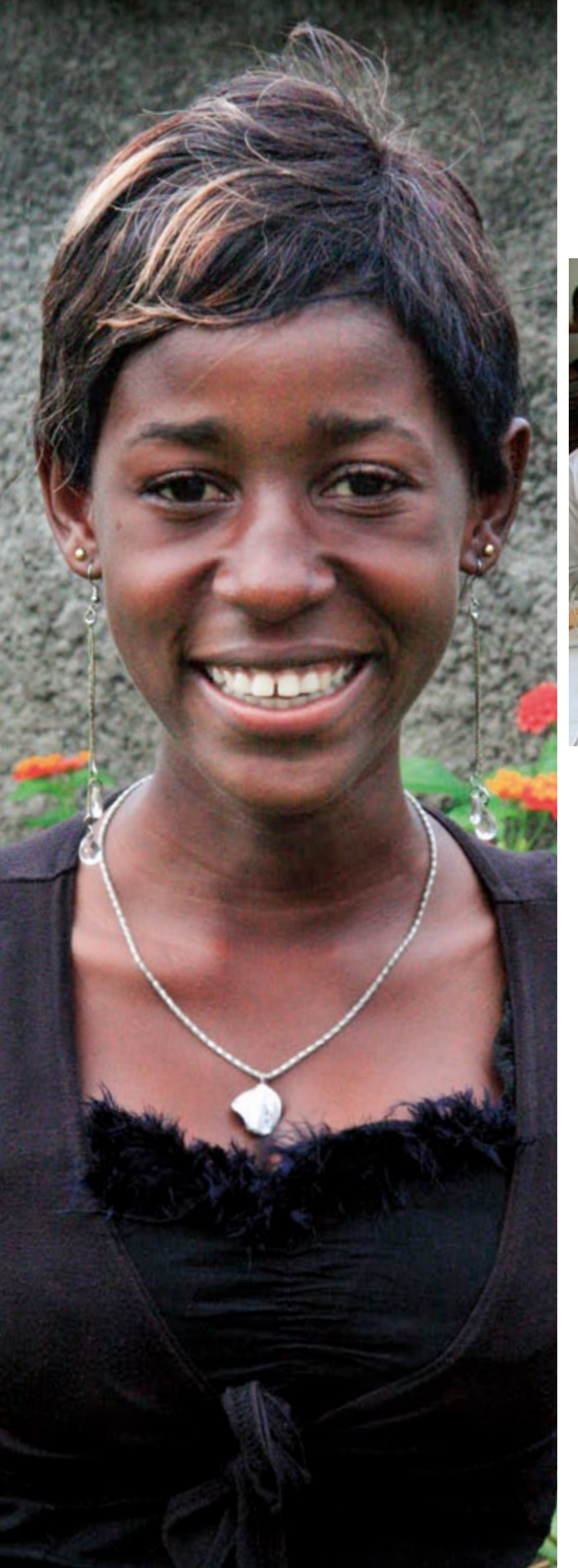
Striving to always remember the Savior, members are strengthened and renewed by partaking of the sacrament.