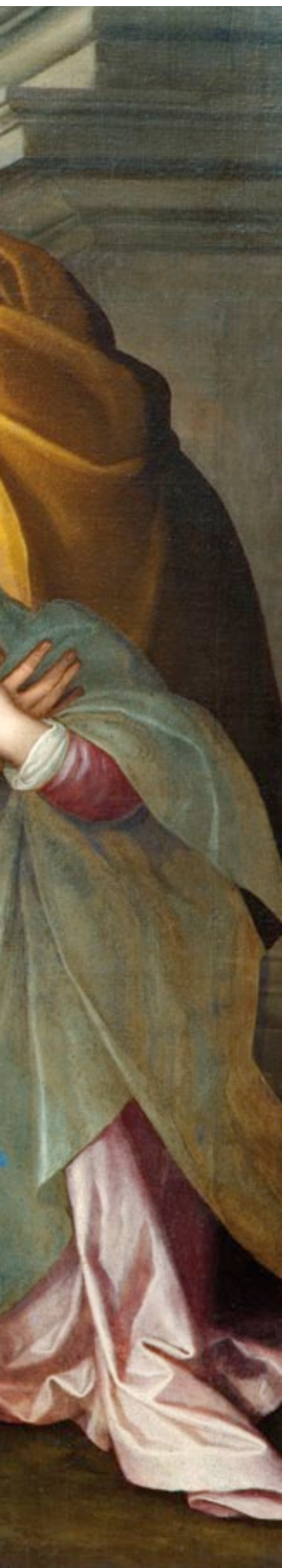
NATIVITY SCENE BY BERNARDINUS, INDISUR FROM ISTOCKPHOTO/THINKSTOCK