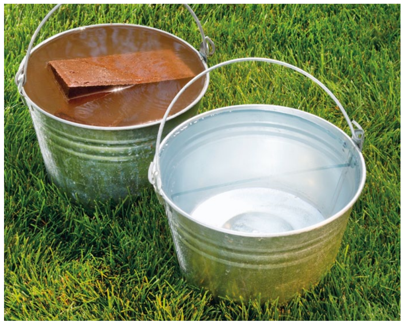
Sin is like a brick dropped into a full bucket of water. Repentance isn't complete by just removing the brick; we must add more water to fill the bucket again.

Ghost to overcome our weaknesses. Our problems and weaknesses will not be completely taken away, but just as the Lord strengthened Alma and his people "that they could bear up their burdens with ease" (Mosiah 24:15), we too can be blessed with comfort and understanding to make our burdens lighter. We too can "submit cheerfully and with patience to all the will of the Lord" (Mosiah 24:15). This kind of aid comes as a blessing of living the gospel of Jesus Christ.<sup>4</sup>