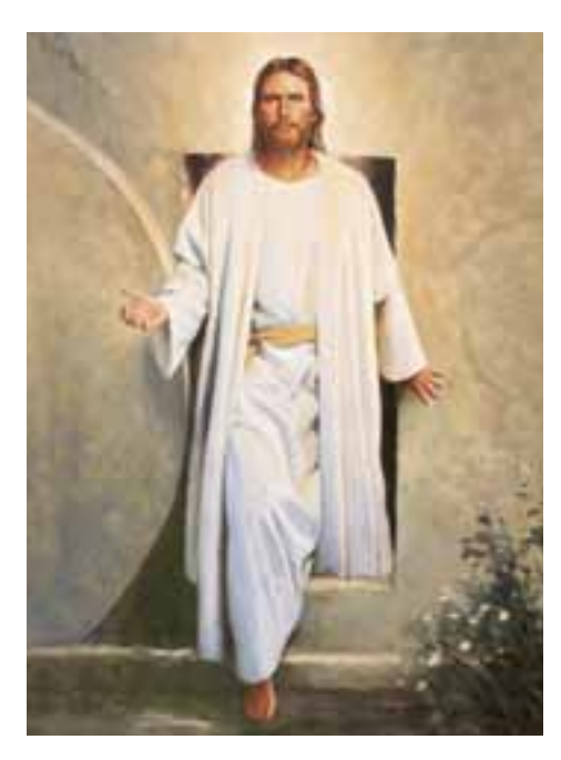
He who did not need to die Himself was willing to be bound by the chains of death so He could break them for all mankind.

I testify that, though He never needed it, He gave to us what we desperately needed—that program of progress—repentance, which beckons us to betterness. I thank Him for helping me, even forgiving me, when I fall short, when I testify of things known but which are beyond the border of my behavior, and for helping me to advance that border, bit by bit. His