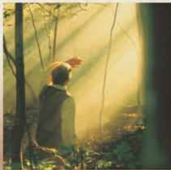
LEFT: STILL IMAGE FROM THE RESTORATION; RIGHT: TAKEN ON THE SET OF JOSEPH SMITH: THE PROPHET OF THE RESTORATION