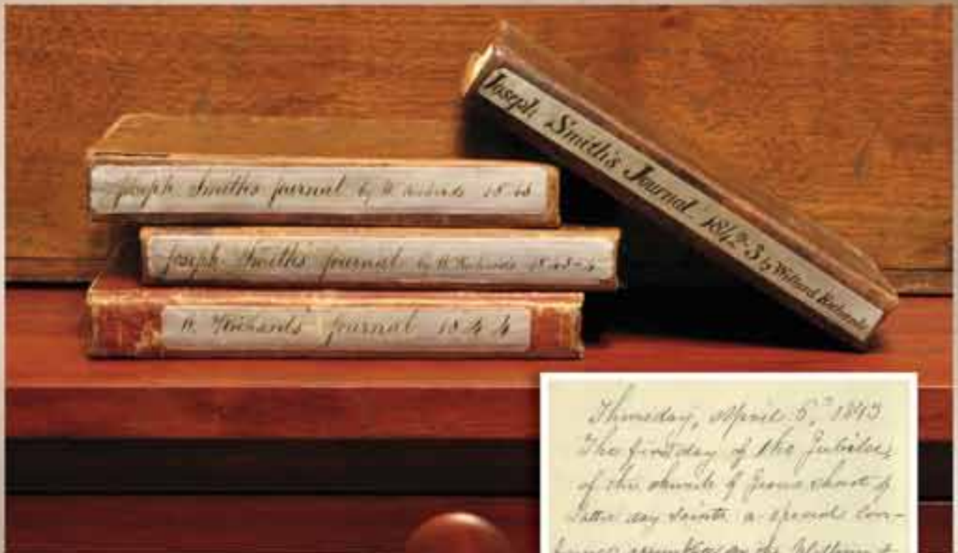
Above: The third Illinois journal is a four-volume set for which Elder Willard Richards acted as scribe. The desk and document box shown here are believed to have come from the Smith family home in Nauvoo. Inset: This journal entry of April 6, 1843, records the opening day of a Church conference in Nauvoo.