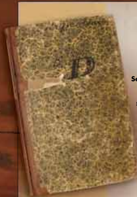
The Prophet's second Ohio journal (above) contains a historical account of Joseph Smith's First Vision (depicted below), and it records the conferral of priesthood keys by Moses, Elias, and Elijah in the Kirtland Temple on April 3, 1836 (opposite page).

The Prophet spent a great amount of time reorganizing priesthood quorums and councils so they would be properly organized for the solemn assembly. He insisted that the brethren be trained in the School of the Elders and in the associated Hebrew school. The journal tells of Joseph's enthusiastic and dedicated study of the Hebrew language during this time. It traces the Prophet's efforts in these endeavors and concludes by describing the dedication of the temple, the solemn assembly, and the Sunday meeting of April 3, 1836. On this Easter morning, the resurrected Christ appeared to the Prophet Joseph Smith and Elder Oliver Cowdery. Moses, Elias, and Elijah then appeared and