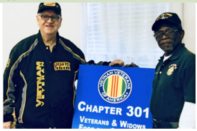
Delivering Christmas food boxes to local veterans and widows, Tuscaloosa, Alabama, USA

"People in the community won't care about us until we show how much we care about them. We have to know more about each other. The only way we are going to do that is if we serve next to each other."