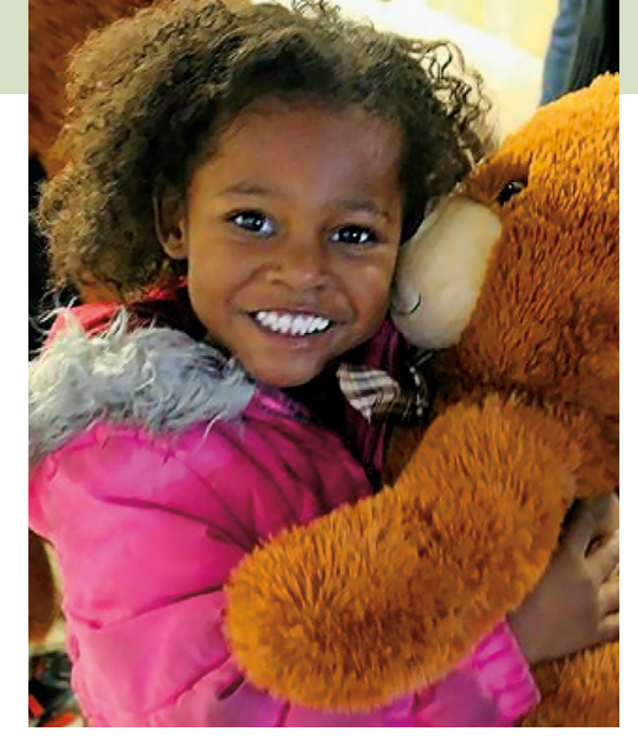
Operation Holiday, Wichita, Kansas, USA

She says, "It's because of JustServe and the mentality of wanting to build bridges in the community that I told them, 'People in the community won't care about us until we show how much we care about them. We have to know more about each other. The only way we are going to do that is if we serve next to each other.'"