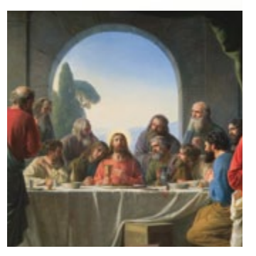
1. Jesus Christ instituted the sacrament among His Twelve Apostles on the night before His Crucifixion (see Luke 22:19-20).