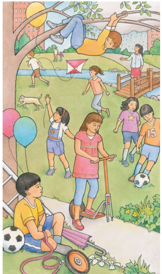
ILLUSTRATION BY BETH M. WHITAKER

When you have dinner with your family, suggest that each family member share one thing he or she did to serve someone that day. Write your own service experiences in your journal each day.