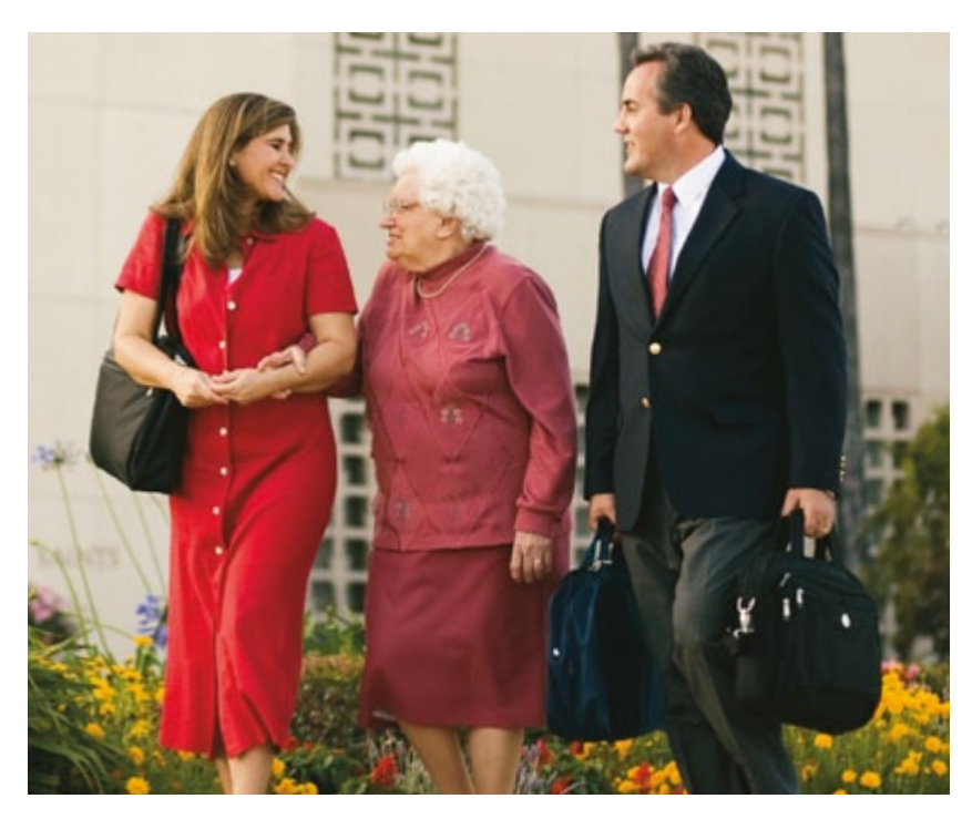
"Think of the devotion and the faithfulness of those who day after day go into these temples and officiate for those who have passed to the other side."

eternal marriage. There are some of our people who have no interest in their genealogy. They care nothing about their forebears; at least you would think so by the way they behave. They do not go into the temple to do work for their dead. . . .