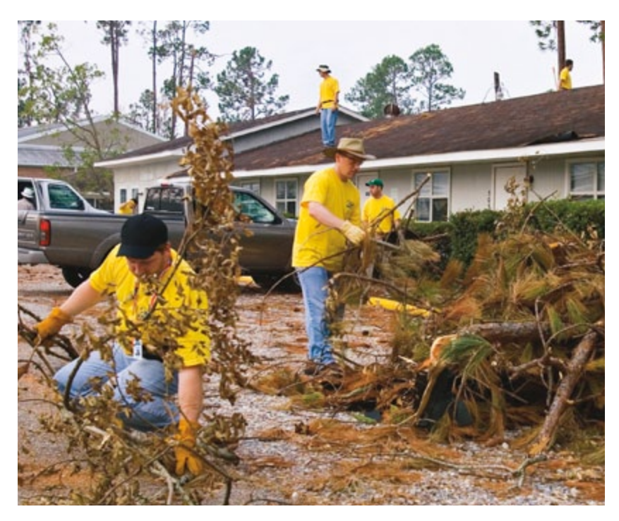
"Let us evidence by our conduct . . . that we do keep that great commandment . . . , "Thou shalt love thy neighbor as thyself."

if we are ministering as he desires that we should minister, every day of our lives is enriched by the influence of his Spirit, our love of our fellowmen increases and our souls are enlarged until we feel that we could take into our arms all of God's children, with a desire to bless them and bring them to an understanding of the truth.<sup>9</sup>