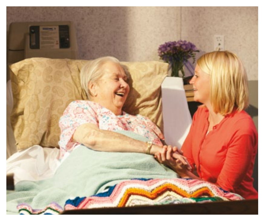
"Go about radiating sunshine, developing happiness and lifting up those who are discouraged, and bringing joy and comfort to those who are in distress."

You cannot drive people to do things which are right, but you can love them into doing them, if your example is of such a character that they can see you mean what you say. <sup>15</sup> [See suggestion 4 on page 19.]