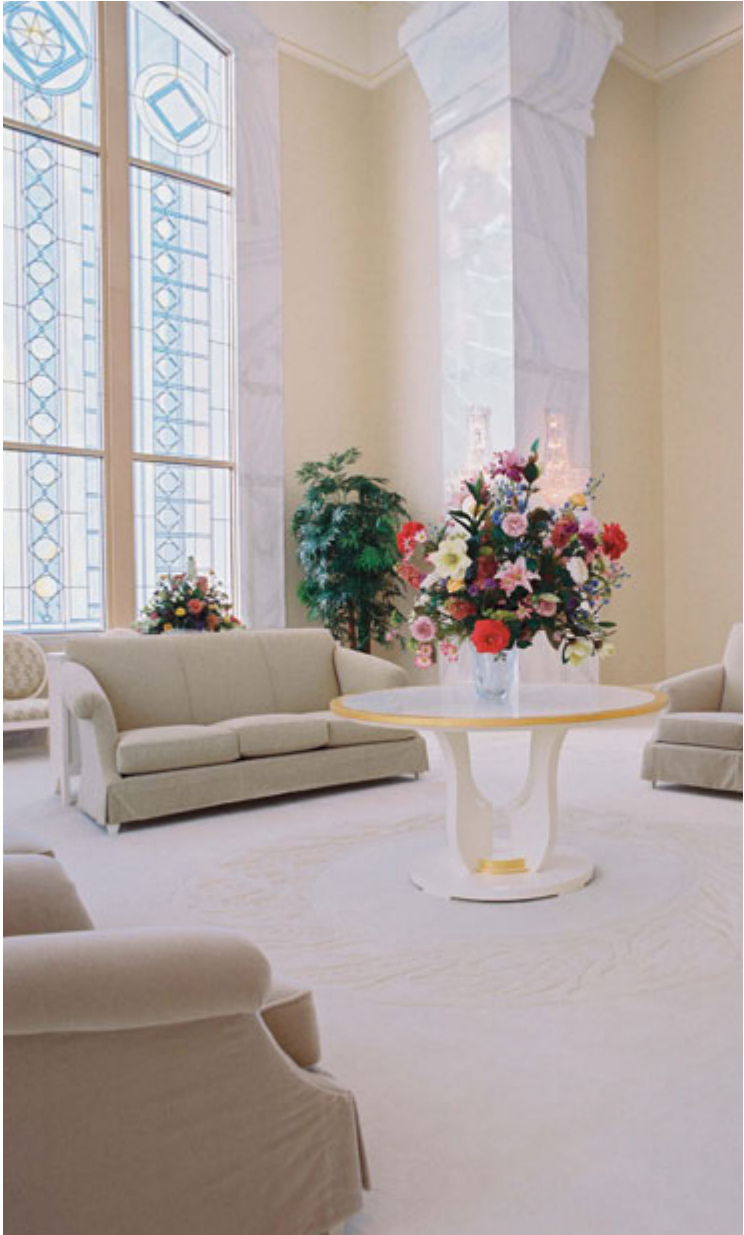
Celestial Room, Columbia River Washington Temple