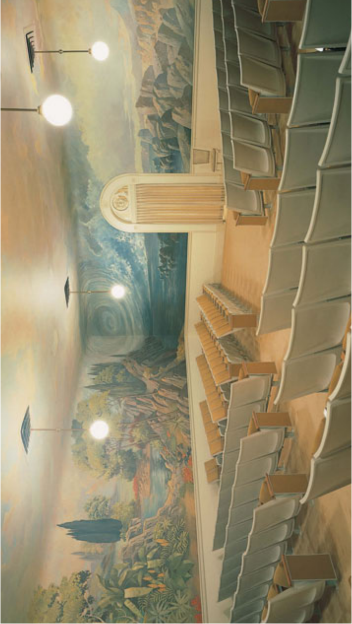
Creation Room, Salt Lake Temple