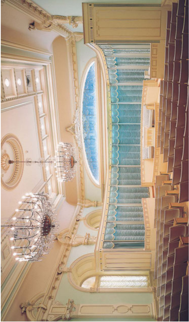
Terrestrial Room, Salt Lake Temple