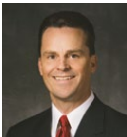
By Elder Shayne M. Bowen Of the Seventy

Sometimes as we move through our journey here below, we underestimate the value of the precious pebbles that God places in our paths. These pebbles may seem small and insignificant, but in reality they are treasures of eternal worth.