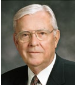
By Elder M. Russell Ballard