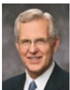
Elder D. Todd Christofferson of the Quorum of the Twelve Apostles, “When Thou Art Converted,” Ensign , May 2004, 11.

spiritual impressions, and writing down the impressions and insights that come so you can remember and learn more.”