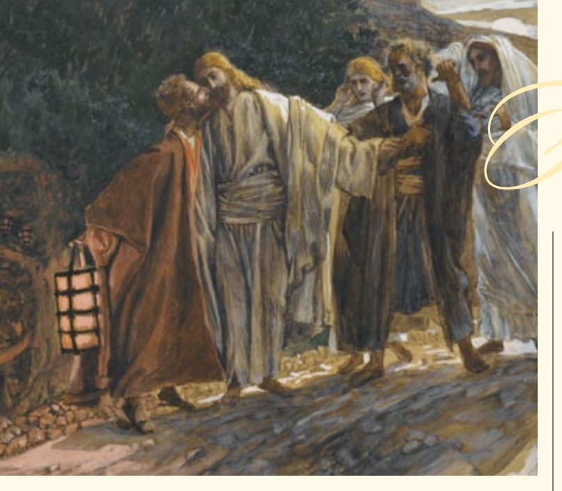
Jesus Christ was betrayed by Judas Iscariot (above) and allowed Himself to be taken, tried, and tortured.