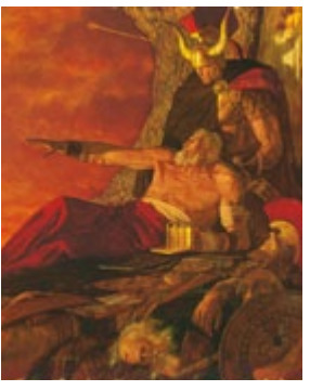
Mormon's and Moroni's closing appeals