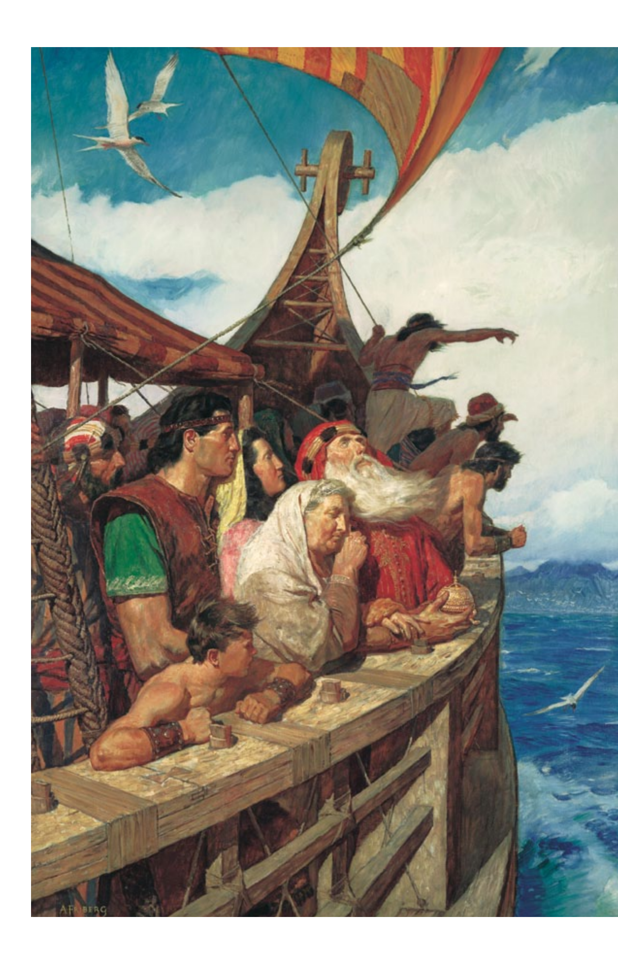
The Book of Mormon's accounts are replete with parents seeking to instill in their children the promise and hope of Jesus Christ.