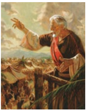
King Benjamin's sermon