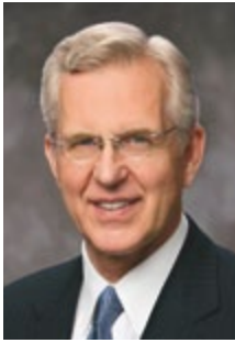
By Elder D. Todd Christofferson