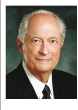
By Elder Robert D. Hales Of the Quorum of the Twelve Apostles