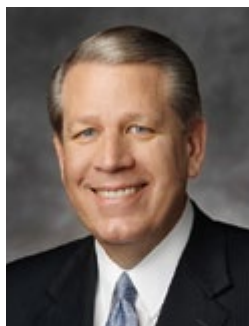
By Elder Donald L. Hallstrom Of the Presidency of the Seventy