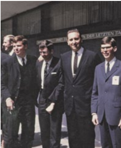
Top: A portrait of President Monson in the 1960s. Above: With members and missionaries in Germany. Below, from left: As bishop of the Sixth–Seventh Ward with his counselors; talking with Boy Scouts; visiting the Tongan Mission in 1965.