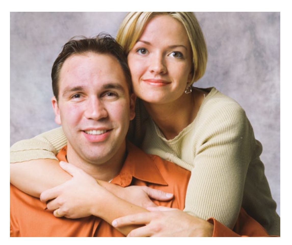
I assure you that the joy, love, and fulfillment experienced in loving, righteous families produce the greatest possible happiness we can achieve.

of the world. Most people will marry and be blessed with children. There is no greater blessing in this life than having children. Some of the most poignant passages in all of scripture capture the sublime significance of children in our Heavenly Father's plan. They are truly "an heritage of the Lord" (Psalm 127:3).