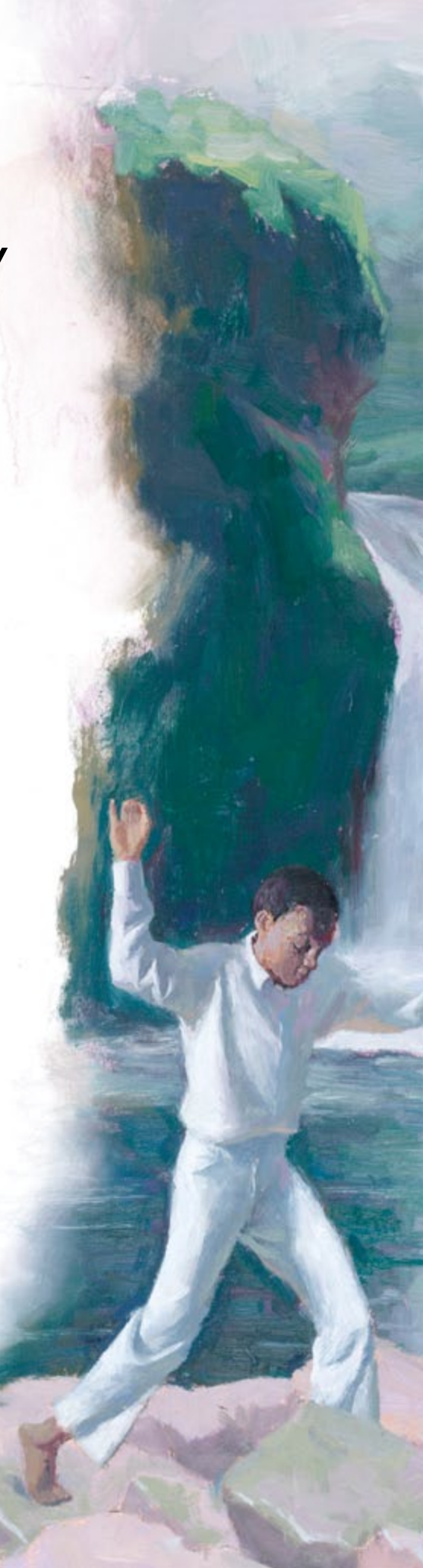
ILLUSTRATION BY ALLAN GARNIS

We opened by singing the hymn “The Spirit of God” ( Hymns , no. 2).