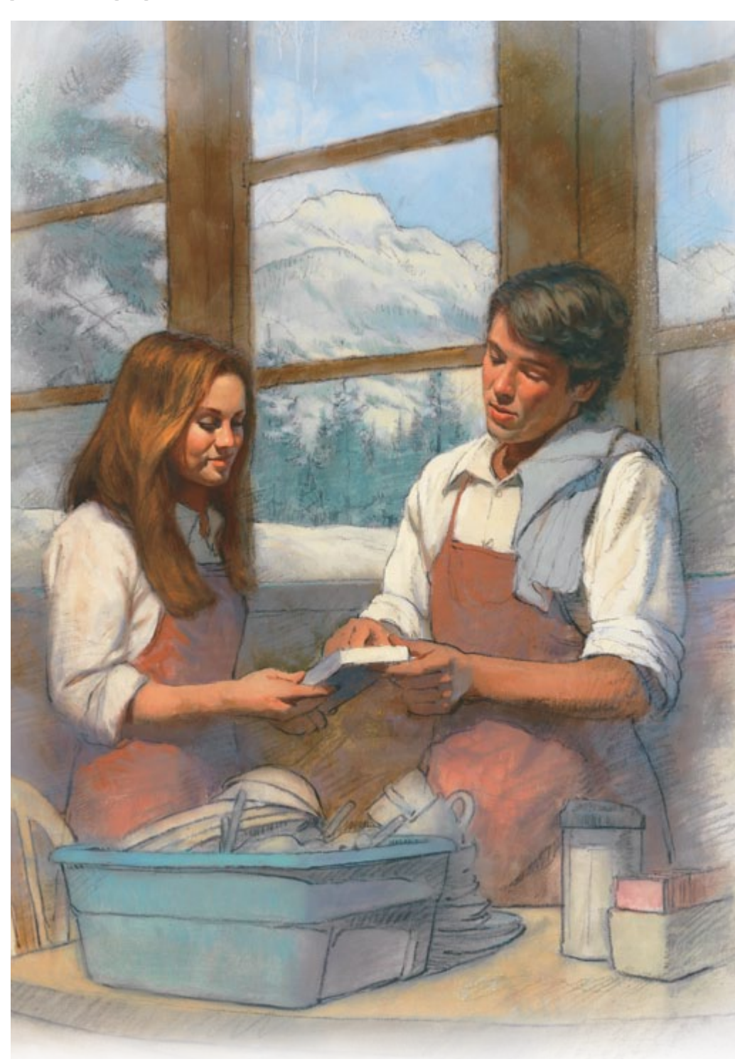
A co-worker handed me a book and said he wanted me to have it. My curiosity was sparked.