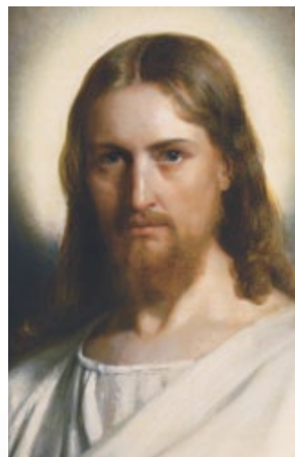
DETAIL FROM CHRIST WITH BOY, BY CARL HEINRICH BLOCH

Elder Dallin H. Oaks of the Quorum of the Twelve Apostles, “Teachings of Jesus,” Liahona and Ensign , Nov. 2011, 93.