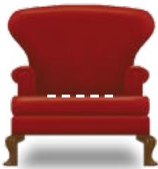
Henry B. Eyring First Counselor