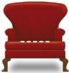
Dallin H. Oaks