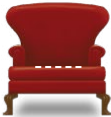
Jeffrey R. Holland