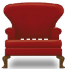
D. Todd Christofferson