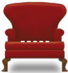
Dieter F. Uchtdorf Second Counselor