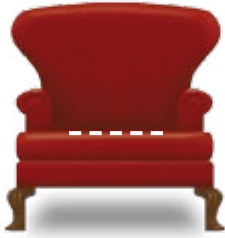
Russell M. Nelson