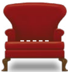
Quentin L. Cook