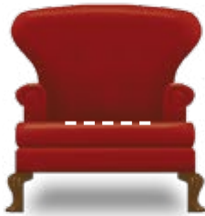
M. Russell Ballard