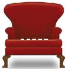
Thomas S. Monson President