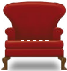
David A. Bednar