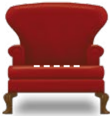
Richard G. Scott