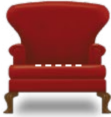
L. Tom Perry