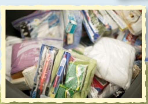
Toothbrushes and other supplies go to children in orphanages and people in disaster areas.

What is given Clothes and shoes Quilts School kits Wheelchairs Disaster supplies (food, clothes, medical supplies)