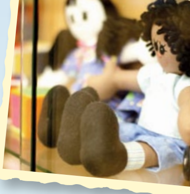
The Humanitarian Center sends dolls and other toys to children in need.