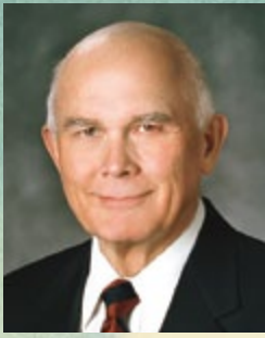
Elder Dallin H. Oaks of the Quorum of the Twelve Apostles shares some thoughts on this subject.