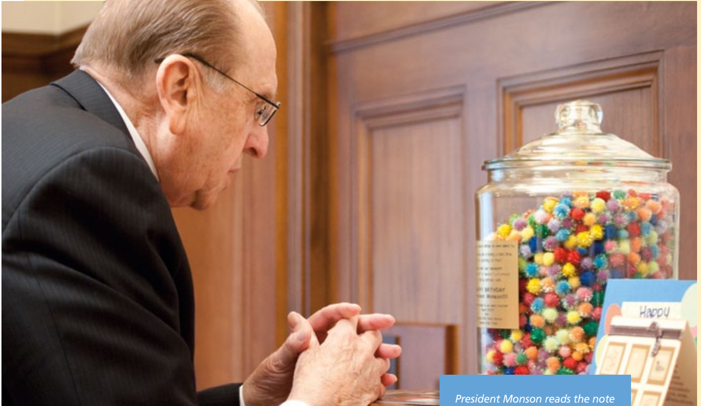
President Monson reads the note on the jar of "warm fuzzies."

A few years ago, a reporter asked what birthday gift members worldwide could give to me. I replied, "Find someone who is having a hard time or is ill or lonely, and do something for him or her."