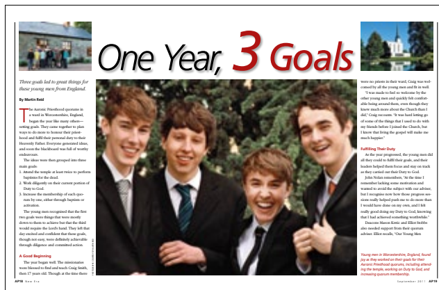
Three goals led to great things for these young men from England.