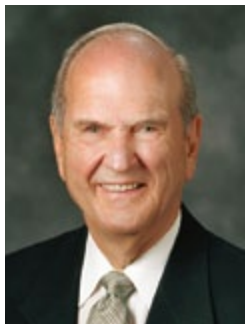
By Elder Russell M. Nelson

To watch the video of President Uchtdorf's address, scan this image with a QR-enabled smartphone.