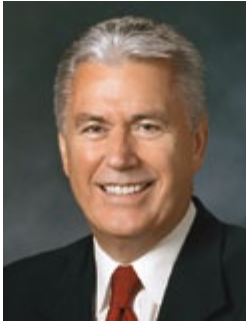
By President Dieter F. Uchtdorf Second Counselor in the First Presidency