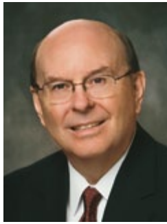
By Elder Quentin L. Cook Of the Quorum of the Twelve Apostles

My prayer, brothers and sisters, as we think about our covenants is that we may keep ourselves strong against "the fiery darts of the adversary" (1 Nephi 15:24), following the Savior's example so that we may sow in the Spirit and abide in the Lord's territory. Let us remember President Monson's formula: "You can't be right by doing wrong; you can't be wrong by doing right." I say these things in the name of Jesus Christ, amen. ■