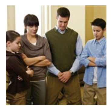
5. We sustain our leaders by praying for them (see D&C 107:22).

"You will all abide the pledge you have given to the Lord and to one another by the uplifted hand, that you all mean to uphold and sustain these officers in all these various organizations, that . . . you will do everything you can to help them, to benefit them, bless them, and encourage them in the good work in which they are engaged."