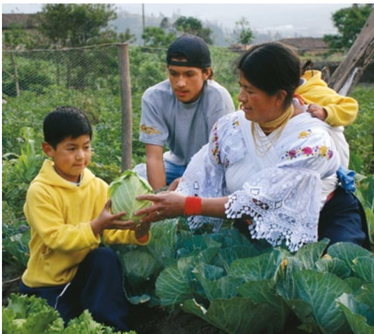
Left, top: Dutch Saints harvest and load potatoes for German Saints in 1947. Above: Food-production training in Ecuador has helped members grow more productive gardens.

Self-reliance involves several facets of a balanced life, including (1) education, (2) health, (3) employment, (4) family home production and storage, (5) family finances, and (6) spiritual strength.