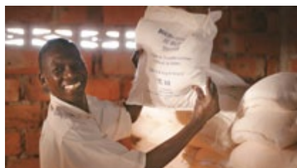
Families in the Democratic Republic of Congo work together to grow cassava as a food staple and to process the root into flour for daily use and for longer-term storage.

"This new [home storage] program is within everyone's grasp. The first step is to begin. The second is to continue. It doesn't matter how fast we get there so much as that we begin and continue according to our abilities."