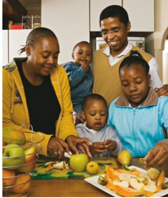
Far left: Latter-day Saint students pursue education to be better prepared to meet the rigors of today's competitive world. Left: Exercise and good nutrition are an important part of treating our bodies with care and respect.