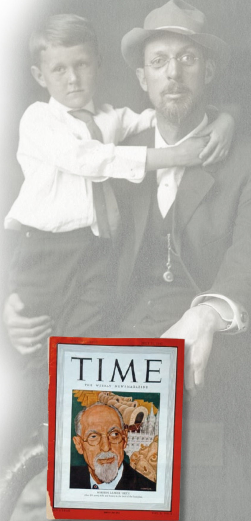
Top: President Smith with his son George Albert Smith Jr. Above: A 1947 issue of Time magazine featured an article about President Smith and the Church.

“This is not an idle dream. These are facts.” 18