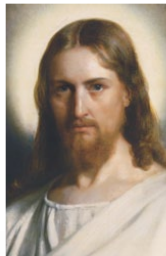
DETAIL FROM CHRIST WITH BOY, BY CARL HEINRICH BLOCH

Elder Dallin H. Oaks of the Quorum of the Twelve Apostles, “Teachings of Jesus,” Liahona and Ensign , Nov. 2011, 93.