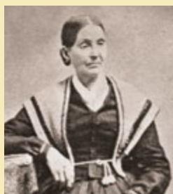
Emma Hale Smith