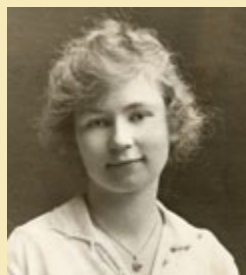
Camilla Eyring Kimball