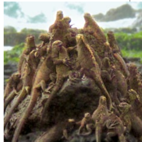
Left: The islands of Santa Cruz (left) and Baltra (right) in the Galápagos. Above: Marine iguanas hold fast to a rock in Tortuga Bay, Santa Cruz.