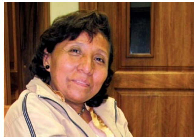
TOP LEFT: PHOTOGRAPH COURTESY OF FLOYD AND SUSAN BAUM