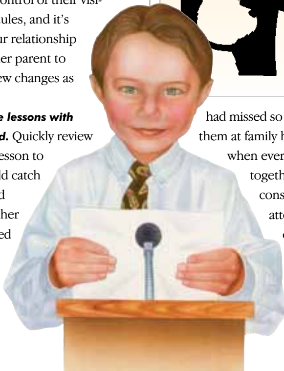
LEFT AND RIGHT: ILLUSTRATIONS BY JOE FLORES; UPPER RIGHT: ILLUSTRATION BY BETH WHITTAKER