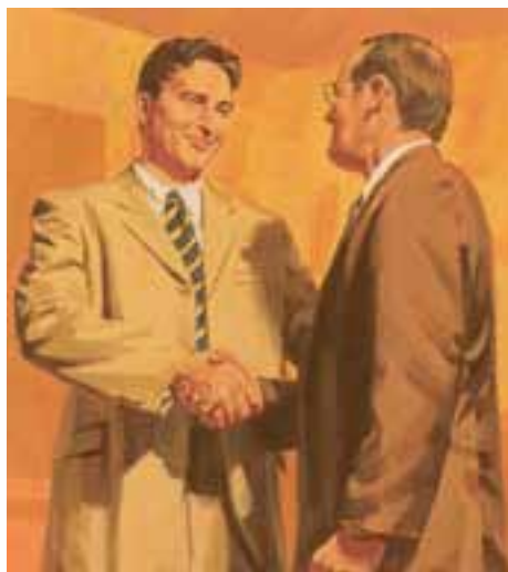
The call was issued and accepted. I said, "I want you to know that you were truly called of God."

Lesson three for me: When we follow the Lord's instructions to study, ask, and receive confirmation of the Spirit before moving ahead on a decision, the Lord's will can be revealed and His purposes more readily accomplished in our lives. I'm grateful for the lessons I learned and for the abiding trust I know we can place in our Heavenly Father to lead us aright. ■