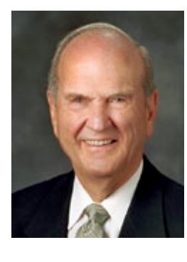
By Elder Russell M. Nelson Of the Quorum of the Twelve Apostles