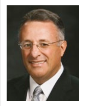
By Elder Ulisses Soares Of the Presidency of the Seventy