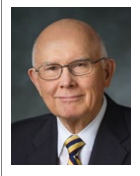
By Elder Dallin H. Oaks Of the Quorum of the Twelve Apostles