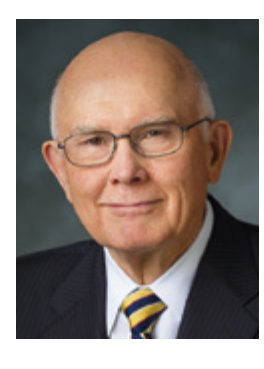
By Elder Dallin H. Oaks Of the Quorum of the Twelve Apostles

It is up to each of us to set the priorities and to do the things that make